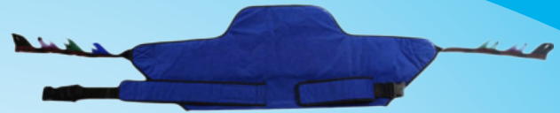
Stand Assist Sling